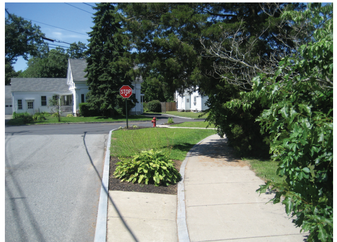
(B) Grass, trees and extended sidewalk in curb extension