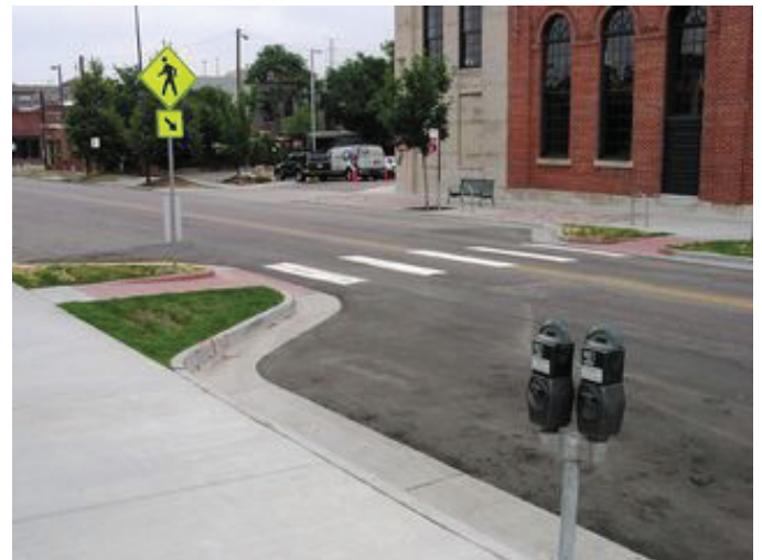
Curb extensions are often associated with mid-block crossings

A sidewalk extension into the street (into the parking lane) shortens crossing distance, increases visibility for walkers and encourages eye contact between drivers and walkers.