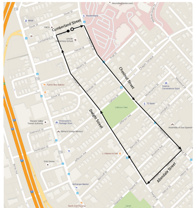
Springfield-Lincoln Elementary School Walk Assessment Map

Approximately 400 students from kindergarten through 5th grade attend the school and nearly 80 percent of students live within walking distance. To facilitate student walking, Lincoln School officials are considering implementing parallel “Walking School Bus” routes, where adult chaperones help groups of children walk to school together, in the mornings along Chestnut and Dwight Streets. The proposed Walking School Bus routes would start about half a mile southeast of the school near Allandale Street. Along these routes, crossing guards are posted during school arrival and dismissal times at the corners Chestnut and Dwight Streets at Waverly Street, the corner of Chestnut Street at Jefferson Avenue and Montmorenci Street, and occasionally at the corner of Dwight Street at Jefferson Avenue.