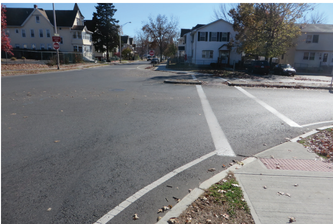
Wide travel lanes and turning radii and a lack of four-way stop signs at the intersection of Chestnut Street with Jefferson Avenue and Montmorenci Street create conditions for fast traffic that poses a risk to pedestrians.