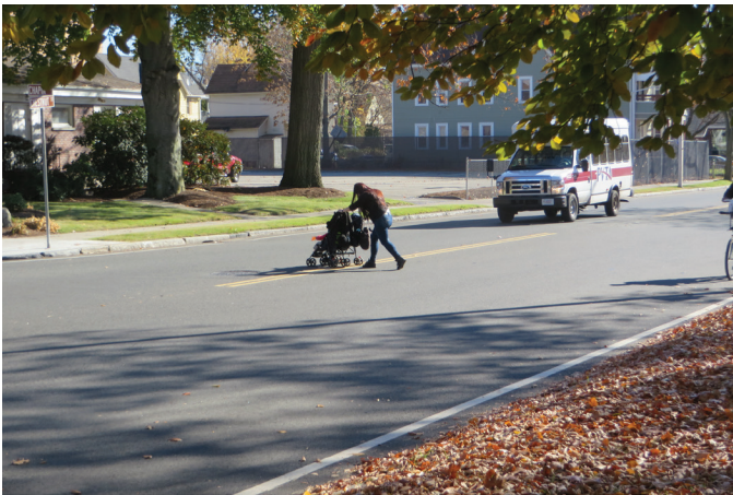
A lack of crosswalks across Chestnut Street between Harriet and Montmorenci Streets often leads to risky pedestrian crossing behavior.