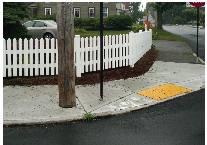
Curb ramp and detectable warning strip in Woburn, MA

Curb ramps provide access from the sidewalk to the street for people using wheel chairs and strollers. They are most commonly found at intersections. While curb ramps have improved access for wheelchair-bound people, they are problematic for visually impaired people who use the curb as an indication of the side of the street. Detectable warning strips, a distinctive surface pattern of domes detectable by cane or underfoot, are now used to alert people with vision impairments of their approach to streets and hazardous drop-offs.