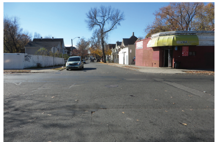
A complete lack of crosswalks at the intersection of Dwight Street and Bancroft Street is emblematic of the broader lack of crosswalks along and across Dwight Street. At this particular intersection, the lack of stop lines on Bancroft Street and the lack of a stop sign on Dwight Street also create additional hazards.

In contrast to Chestnut Street, Dwight Street has a lower traffic volume and does not function as a major pass-through arterial in the Lincoln Elementary School zone. Parked cars and occasional grassy verges along Dwight Street provide buffers between pedestrians and traffic, and the parked cars also help reduce traffic speed. However, a lack of crosswalks and traffic calming measures along and across Dwight Street create safety hazards at several intersections.