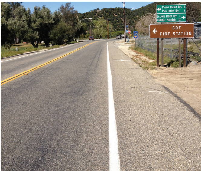
Fog lines delineate the vehicular driving zone on wide roadways.

A fog line is a solid white line painted along the roadside curb that defines the driving lane and narrows the driver's perspective. Fog lines are most often used in suburban and rural locations, but may be appropriate in some urban conditions.