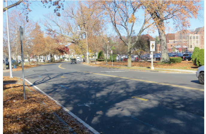
In-pavement "SCHOOL" markings and beacons indicating a 20 mph speed limit in the school vicinity when flashing are present at the corner of Chestnut Street and Waverly Street. However these features are located over a block away from the Lincoln School, where the school is not visible to approaching drivers.