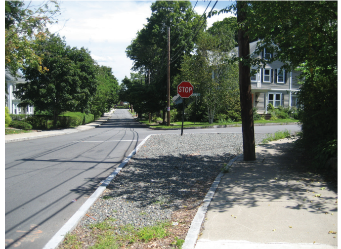
(A) Gravel-filled curb extension