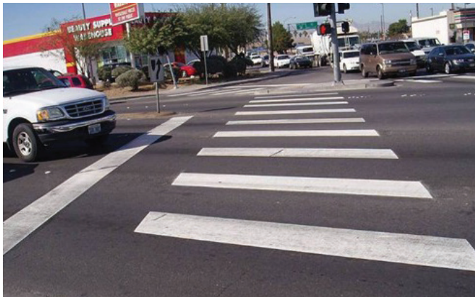
Crosswalk and stop line