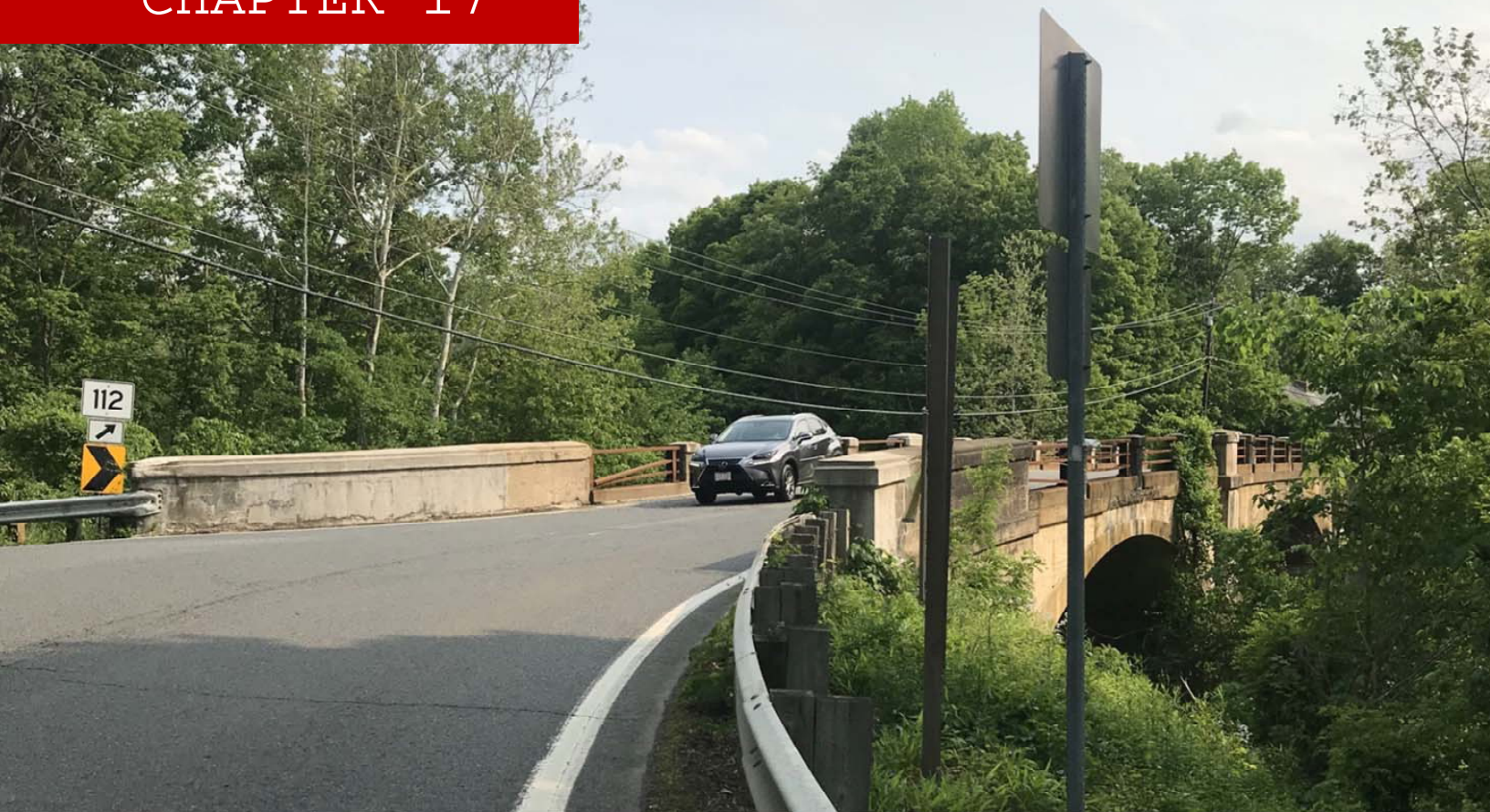
Photo: Route 112 Bridge in Huntington, MA