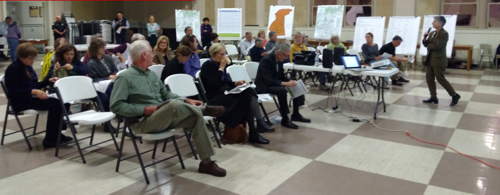
Photo: Public Meeting at South Hadley Town Hall