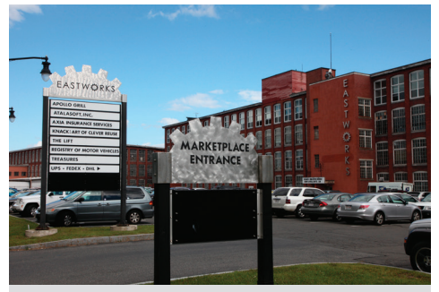
The thriving Eastworks mixed-use development, including housing, commercial and light industrial use on a former Brownfield site