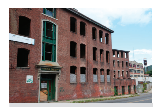
Brownfields site, Easthampton