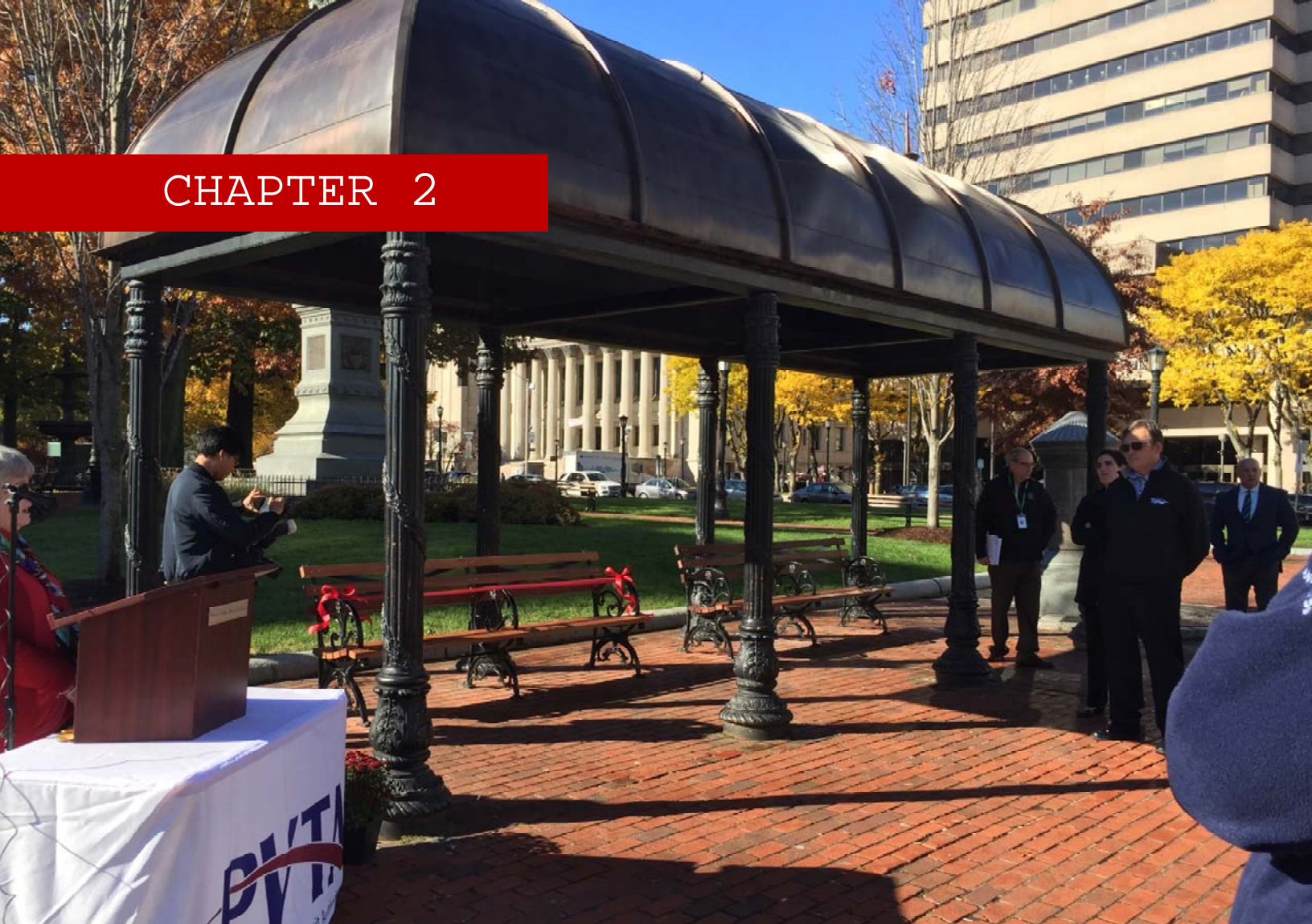
Photo: PVTA Bus Shelter