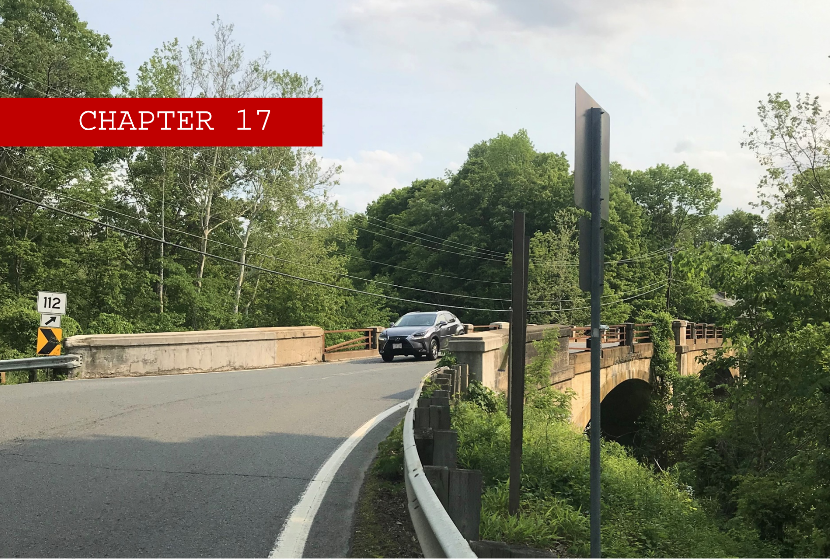
Photo: Route 112 Bridge in Huntington, MA