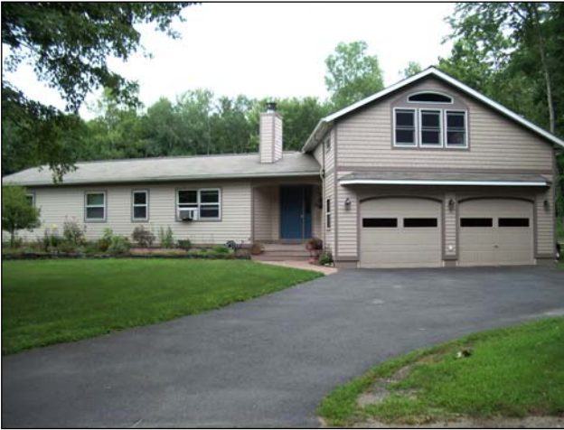
An accessory apartment over the garage in a single family house