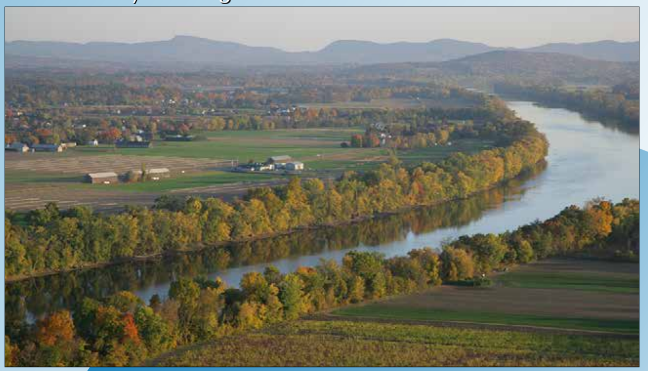
Pioneer Valley Planning Commission