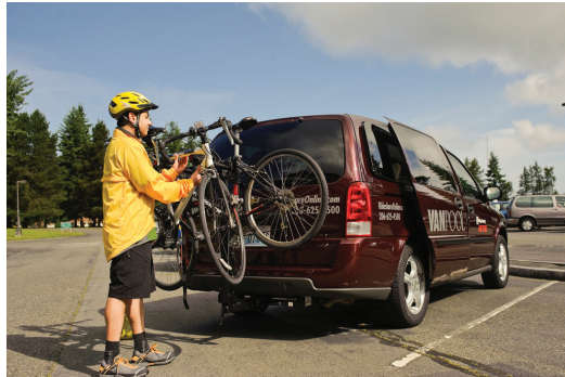
Rideshare Program in Washington State