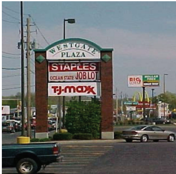
Route 20 in Westfield