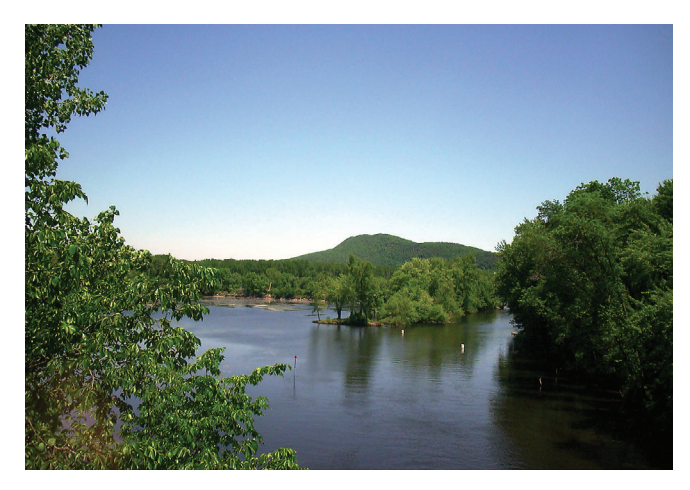
View of the Holyoke Range from Interstate-91