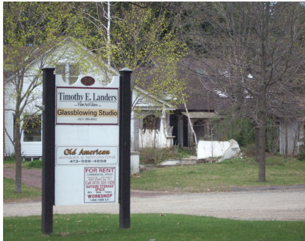
Home based business in Hadley