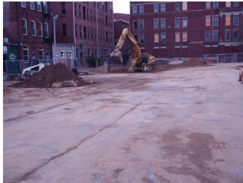
An Underground Storage Tank (UST) site on Maple Street in Holyoke, Massachusetts – prior to construction of the Multimodal Transportation Center.